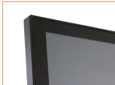
Zero edge bezel