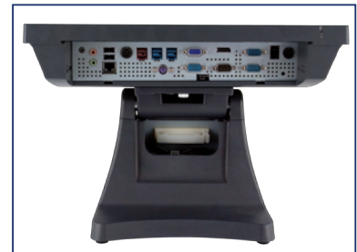
Multiple ports including powered USB and Serial