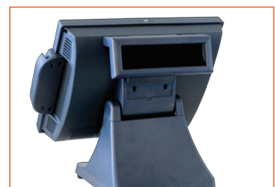
Multiple options including customer display and MSR